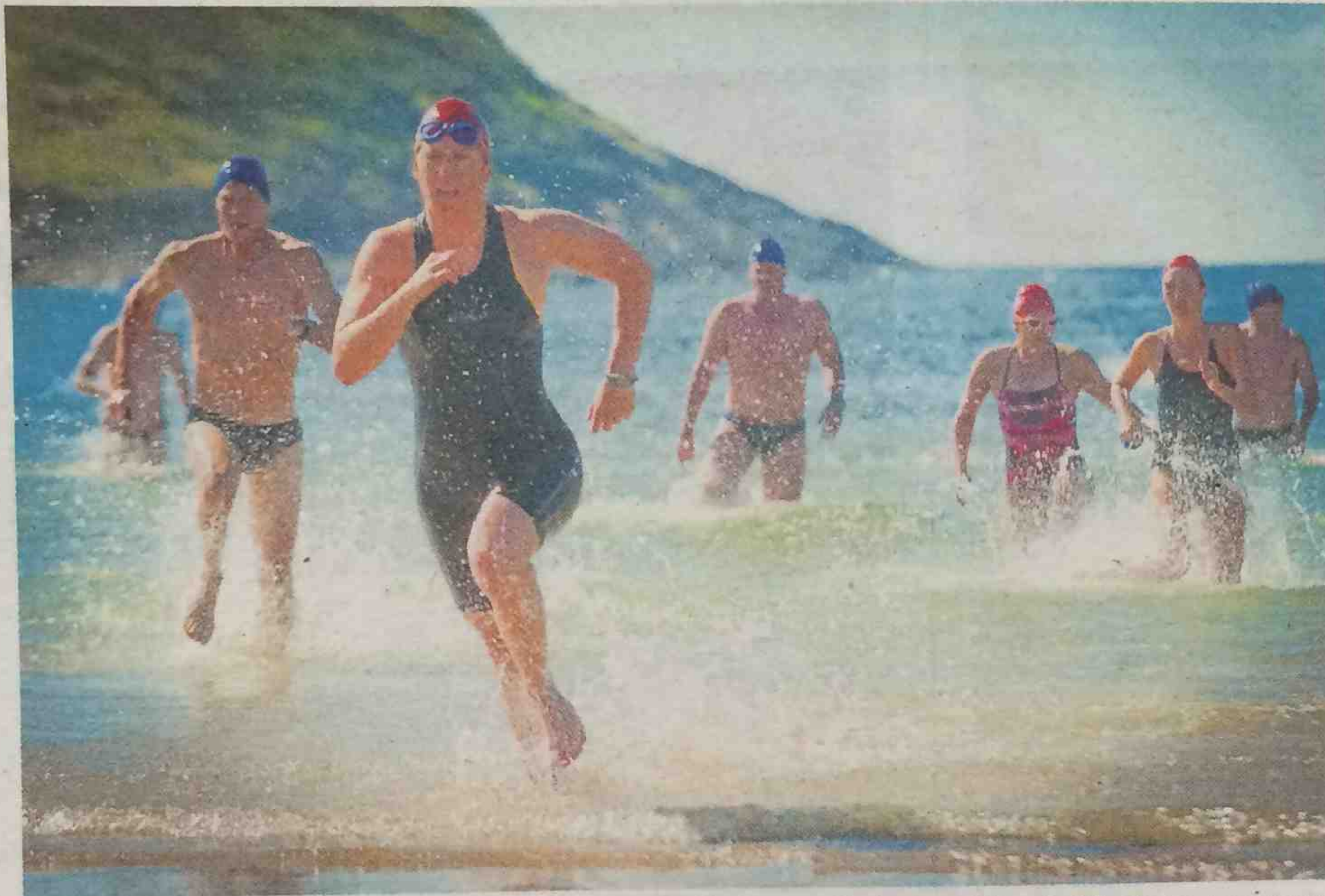
AT THE READY: Entries are filling fast for the Coffs Ocean Swims on March 30.

This year's ANZ 600m Jetty Swim starts a bit earlier than usual with an 8am start to allow for the running of the junior swims.